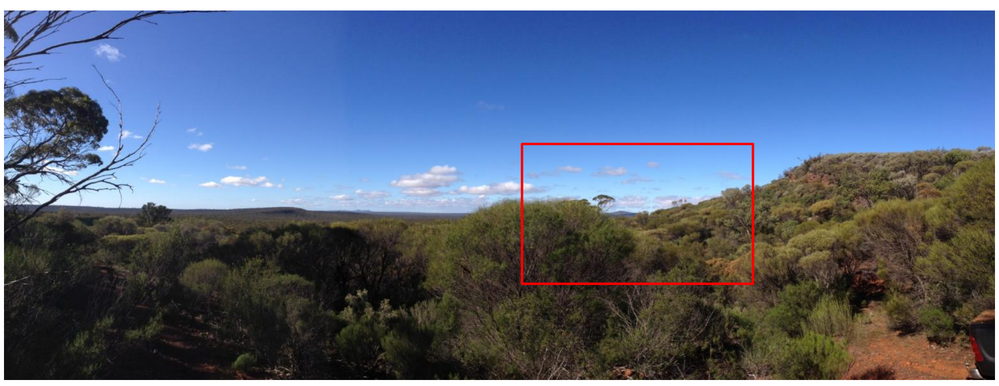
Taken from VIA 1. The view shows from a vantage point the eastern side of the Die Hardy Range including the location of Red Legs.