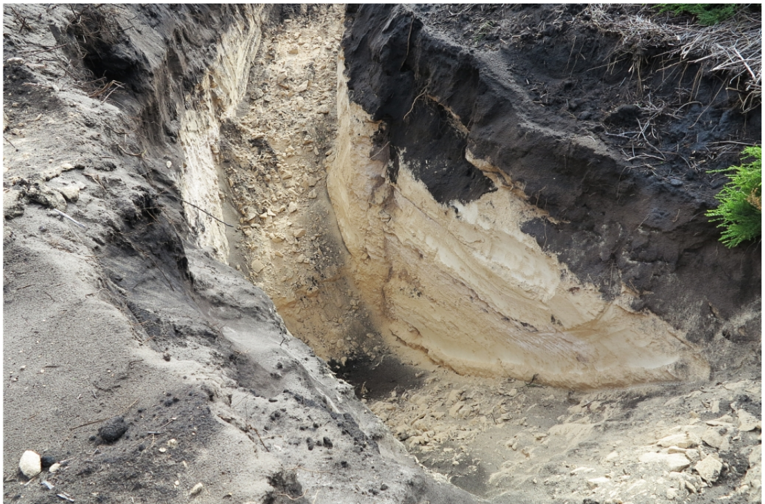
Figure 2 Limestone resource

Although the resource extends to depth, extraction is likely to be initially limited to 8 metres AHD metres to provide an undulating and consistent final landform and to be consistent with the lower elevations available on site.