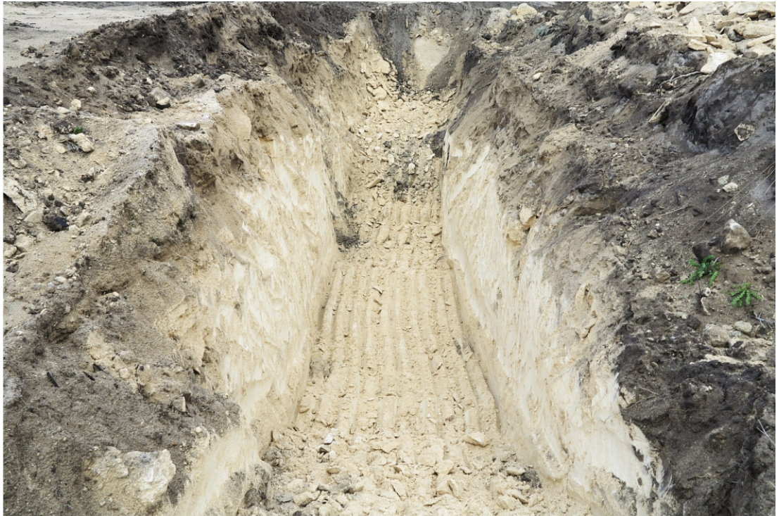
Figure 1 Limestone resource