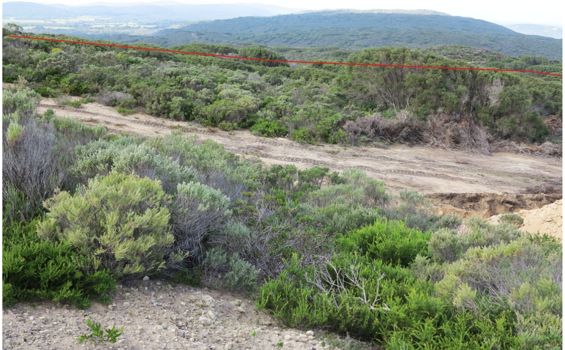
Figure 3 View west across the proposed quarry in the foreground