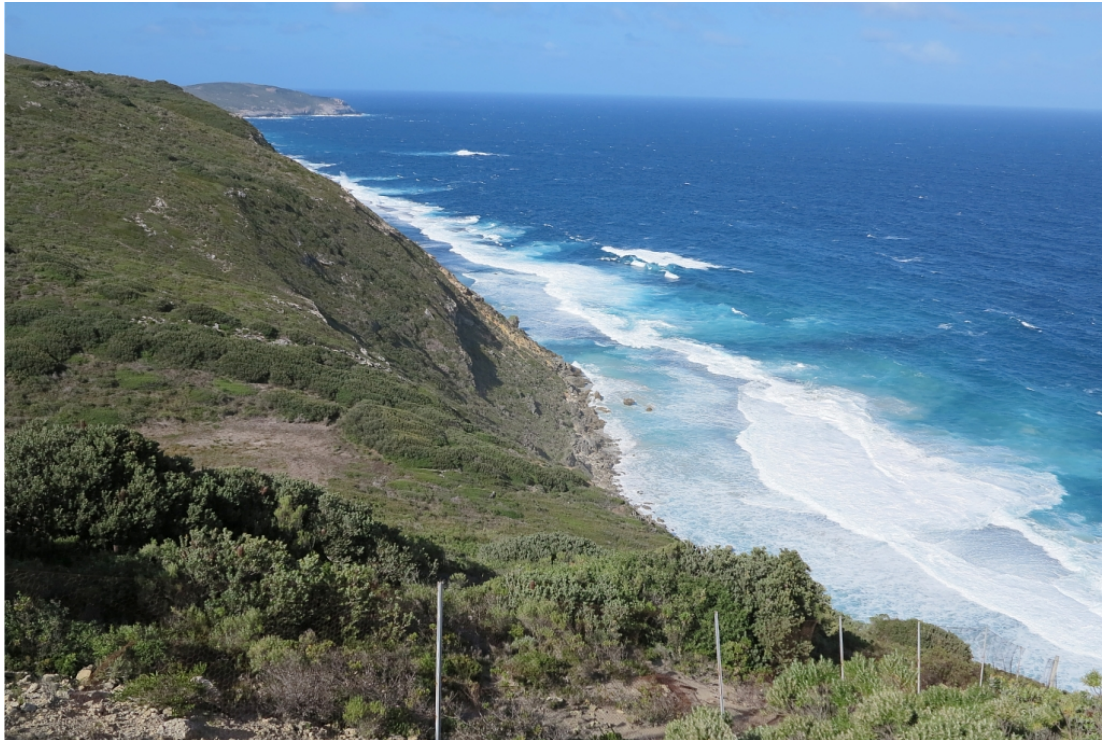
Figure 5 View east along the coast onto Reserve 30883