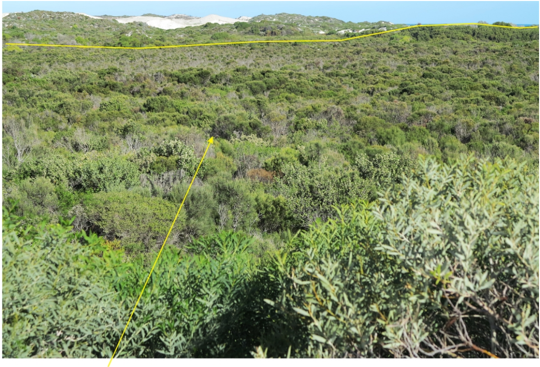
Rehabilitation of limestone - limesand pit at Lancelin