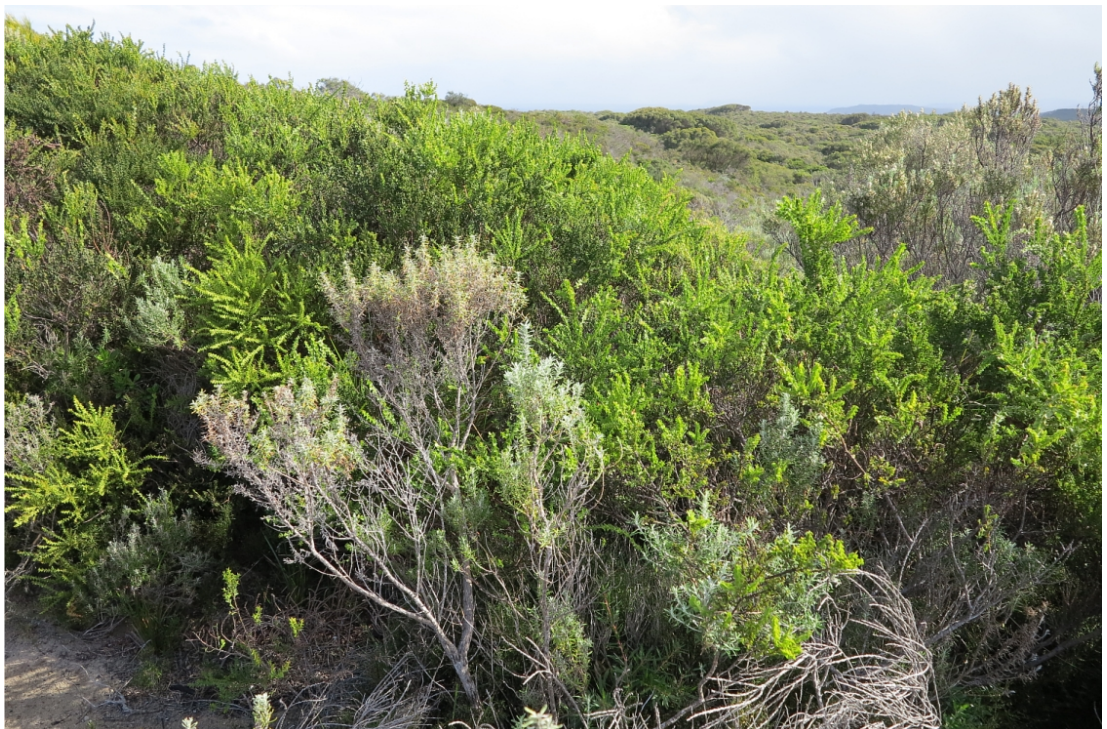
Figure 7 Typical vegetation of the resource area