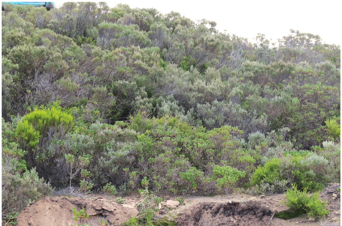
Figure 9 Rehabilitation of a steep slope on the access road to the pit