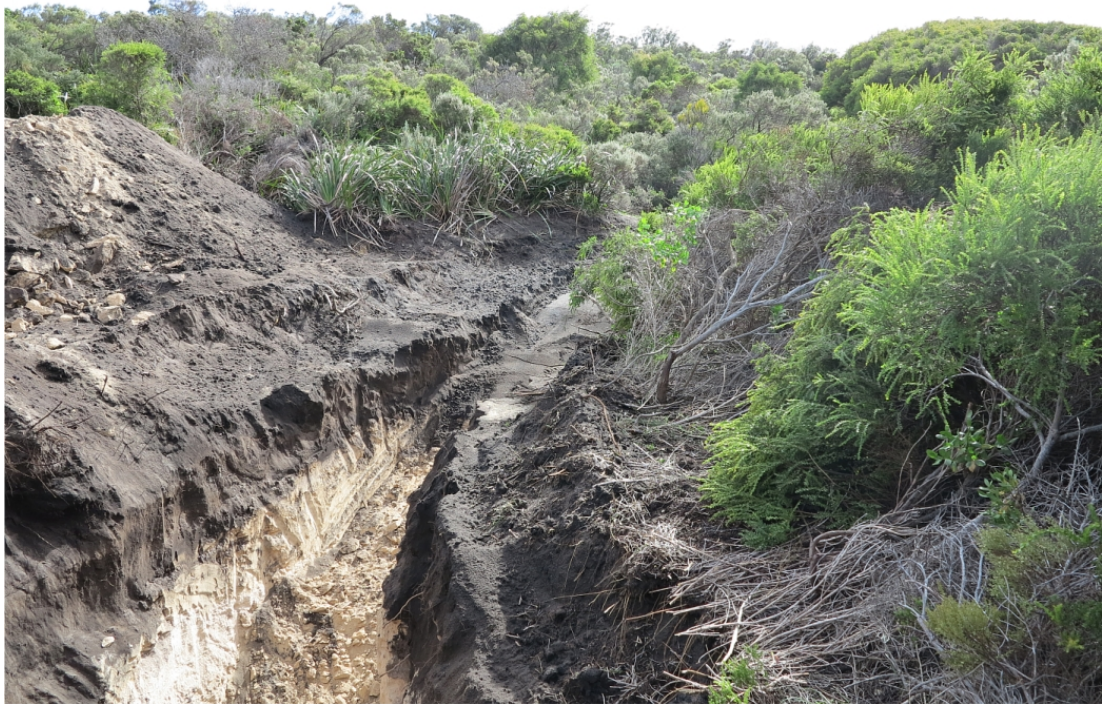
Figure 6 Typical vegetation of the resource area