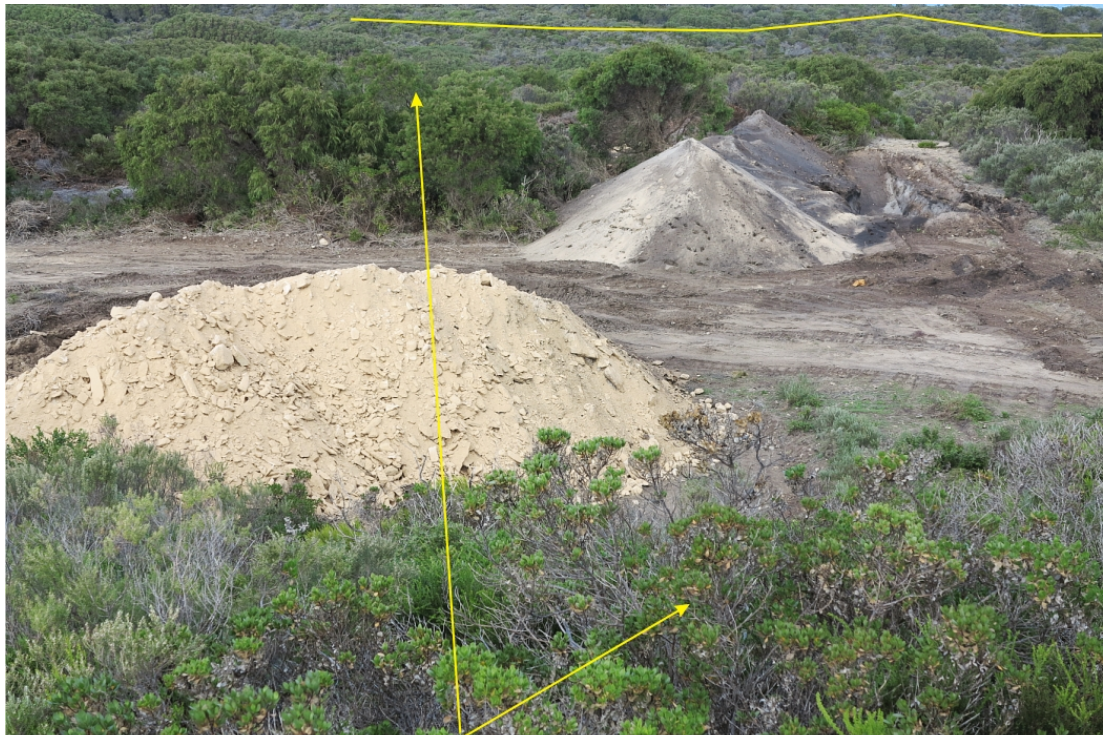
Rehabilitation at the old limestone pit